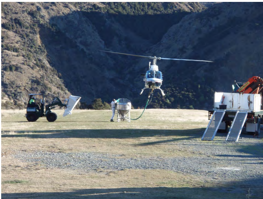
Aerial loading site (image courtesy Marlborough District Council).