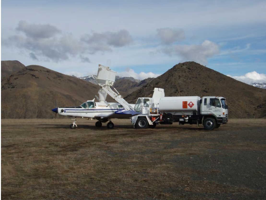
Fixed wing rabbit control operation (image courtesy D Grueber).