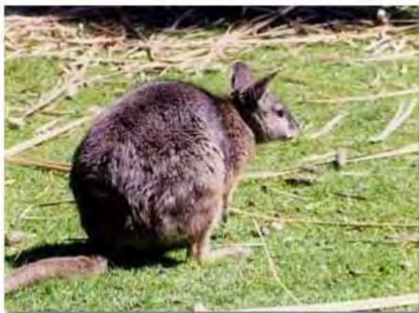
Figure 4. Dama wallaby