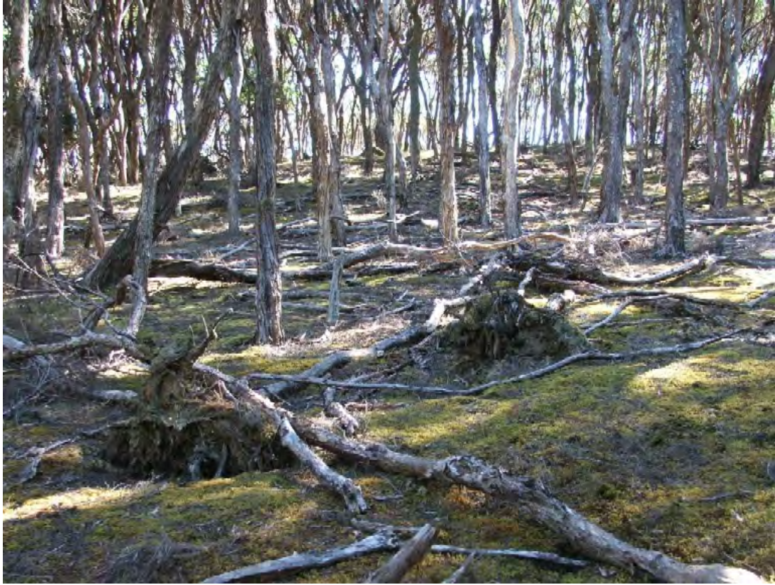
Figure 2. Wallaby impact on Kawau Island

“Nowhere else in New Zealand, has the impact of wallaby browsing advanced so far as on Kawau Island. The mainland observations of species affected are therefore well short of the mark in defining the seriousness of the potential impact of wallabies on ecological and economic values. Technically, wallabies have potential for significantly greater impact on New Zealand ecological values and primary production than possums. Of that I am certain. Of 45 indigenous canopy and sub-canopy species identified on Kawau Island during 1996 only Kanuka ( Kunzea ericoides ) and Kawakawa ( Macropiper excelsum ) stand out as not being attacked by wallabies. With current tools, the cost of eradication may be huge but the job will become impossible if not tackled while the populations are relatively discrete.”