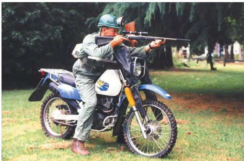
Figure 3. Typical night shooting setup, shooter is also equipped to continue on foot.