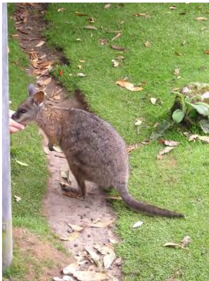
Figure 1. The hand in the left of the picture shows the small size of the dama wallaby.

Females mature at 12 months of age and have no more than one young per year. Young are born from mid-January through December, with some late births to July. Most females mate within 24 hours following the birth of a previous young but the embryo stays dormant until December or January when gestation completes over 28 days. Joeys' pouch life is about 250 days. Few adults live beyond five years' of age.