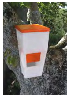
Figure 5. Some examples of suitable bait stations. The Philproof entrance (centre) has been modified allowing ready access to bait and the sides have been cut back so as not to obscure the wallaby's vision when feeding at the station.