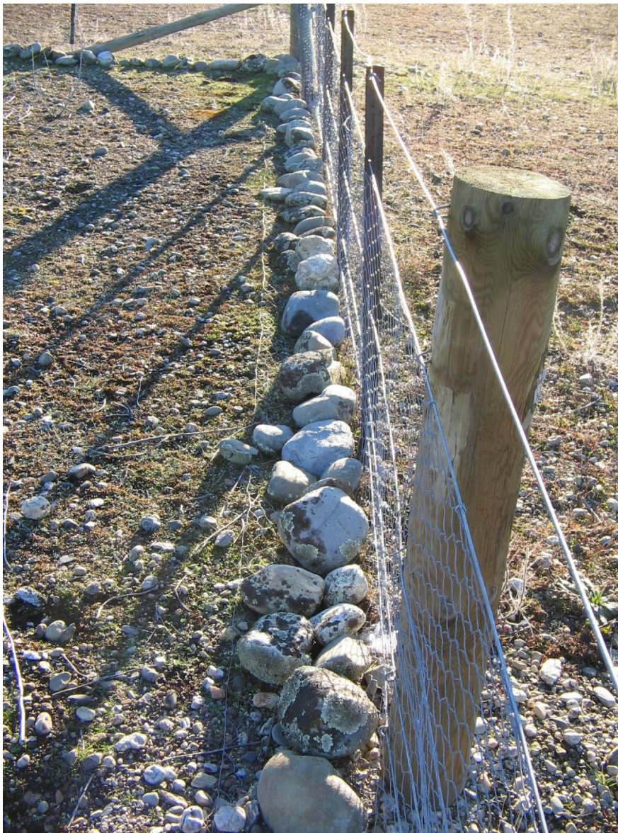
Rabbit-proof fence

Fences should be checked and repairs made at least annually, or as necessary. Regular maintenance will reduce the need for periodic expensive rebuilding and keep the fence in a stock-proof condition.