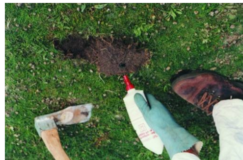
Application of paste bait to earth spit.