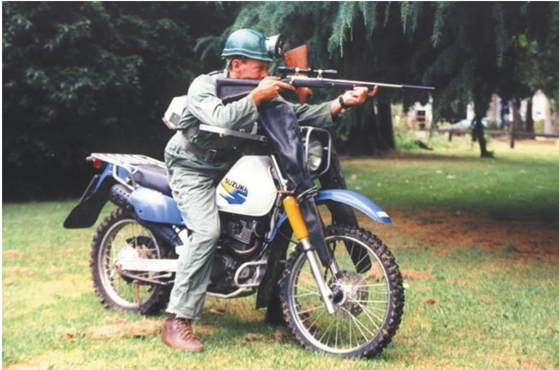
Typical night shooting setup. The shooter is also equipped to continue on foot.