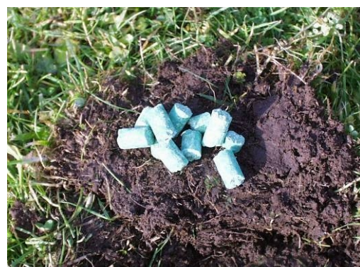
Pellets on spit.