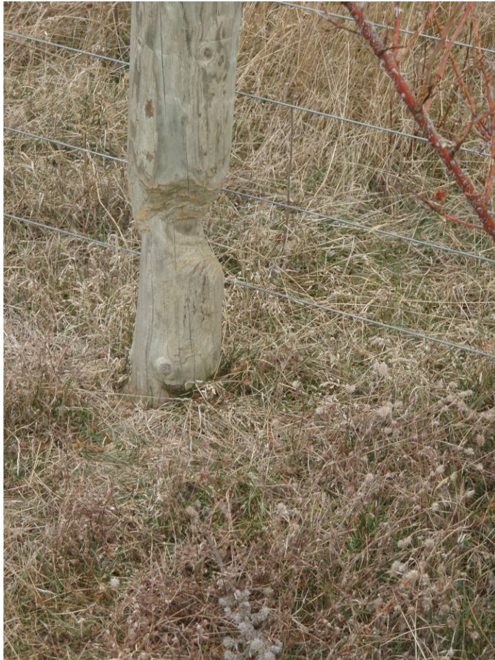
A rabbit-chewed fence post (image courtesy D. Grueber).

Some sensitive ecosystems such as sand dunes and semi-arid systems can suffer from the effects of rabbits. One indirect effect includes acting as a food source for maintaining predator populations which have adverse effects on biodiversity values. Similarly, restoration plantings may not establish in the presence of rabbits. Rabbits eat plants in vegetable and flower gardens, as well as small trees. Rabbits may also ring-bark trees by chewing off the bark.